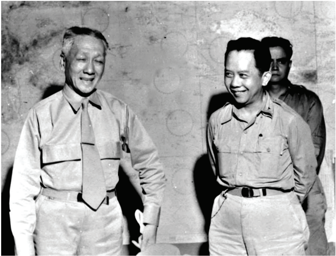
President Sergio Osmeña and Brigadier General Carlos P. Romulo in Leyte, 1944.